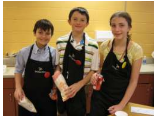
The Café staff was a big hit with the townspeople! Everyone loved the popcorn and soda.