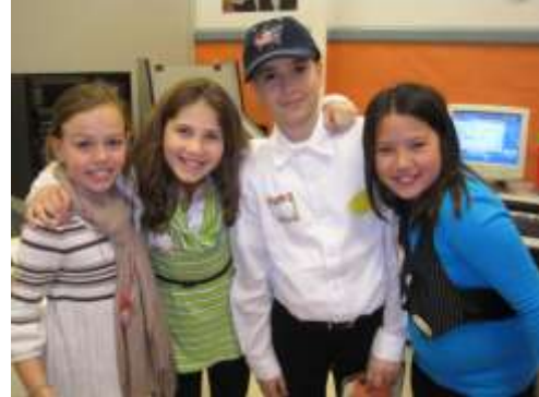
The radio staff played today's greatest hits and aired business advertisements.