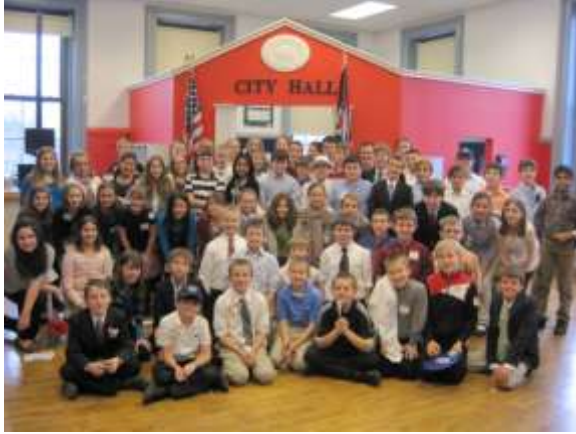
All of the townspeople gather for a picture at City Hall.